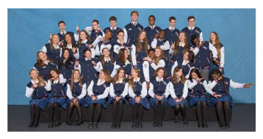
Year 12 Student Numbers