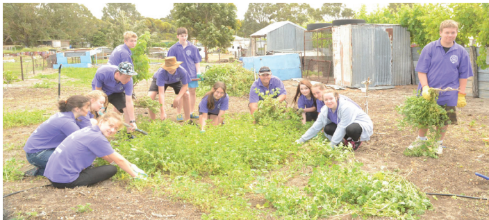
2014 Storm Co trip workers

https://www.facebook.com/year9aspire/?_rdr=p