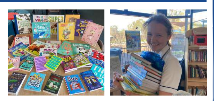
Book Fair - Thank you!

The students' costumes were very imaginative and unique! Your efforts were very much appreciated.