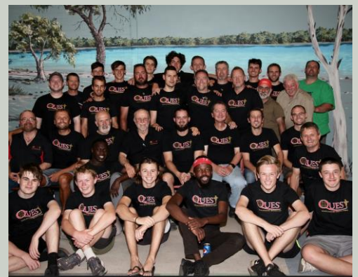
Previous Staff & Participants

Young men (ages 14 -18) who, with the investing support of their families of $300 are wanting to take the next step.