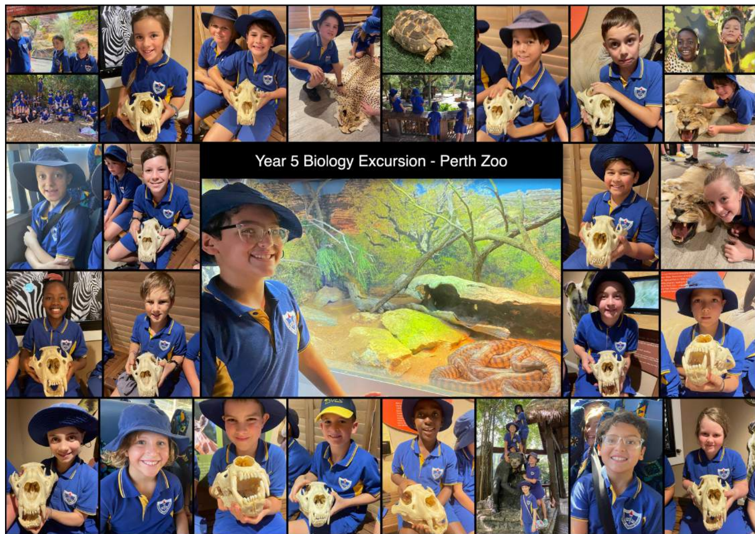
Year 5 Biology Excursion - Perth Zoo

I was inspired: I've got to share this experience with others. I need to get my husband a telescope! Next time you are outside after sunset, look up at the night sky and consider the God who created the heavens; the One who also created and loves you.