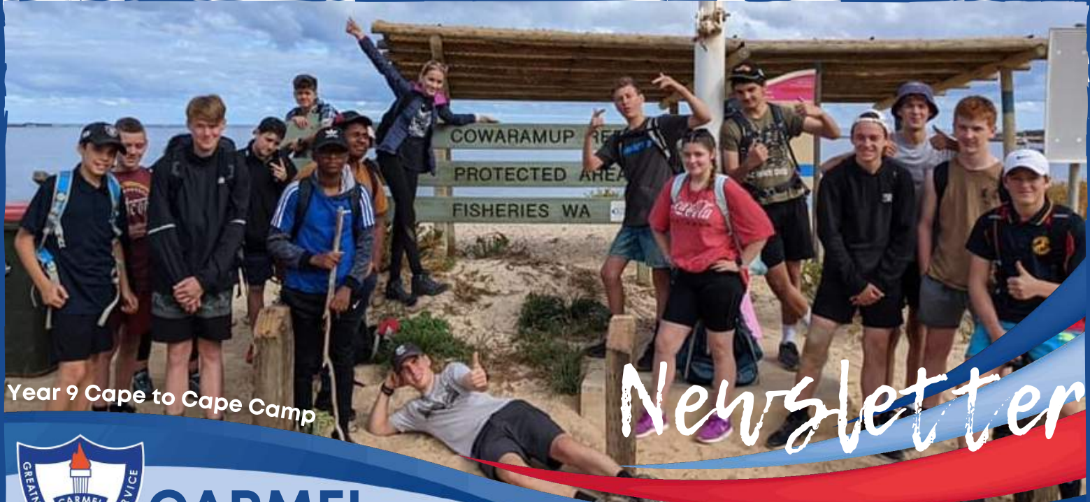
Year 9 Cape to Cape Camp