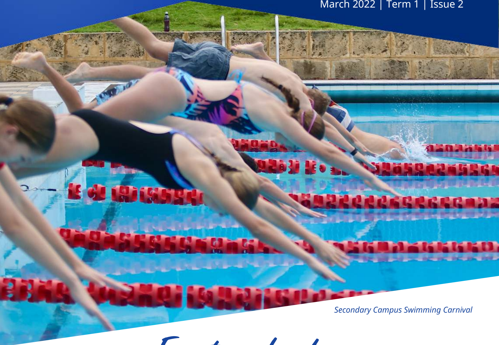
Secondary Campus Swimming Carnival