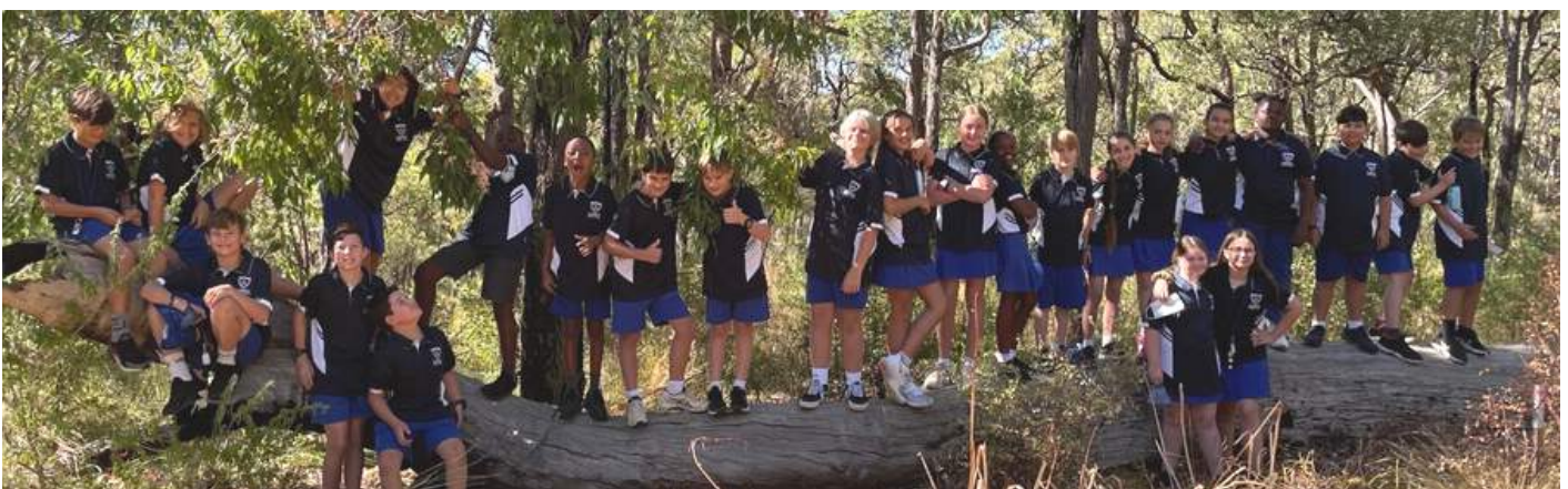
Year 6 class wearing their new leavers shirts!

Swimming certificates will be sent home with your child/ren the week after swimming concludes. A copy will also be kept for our records.