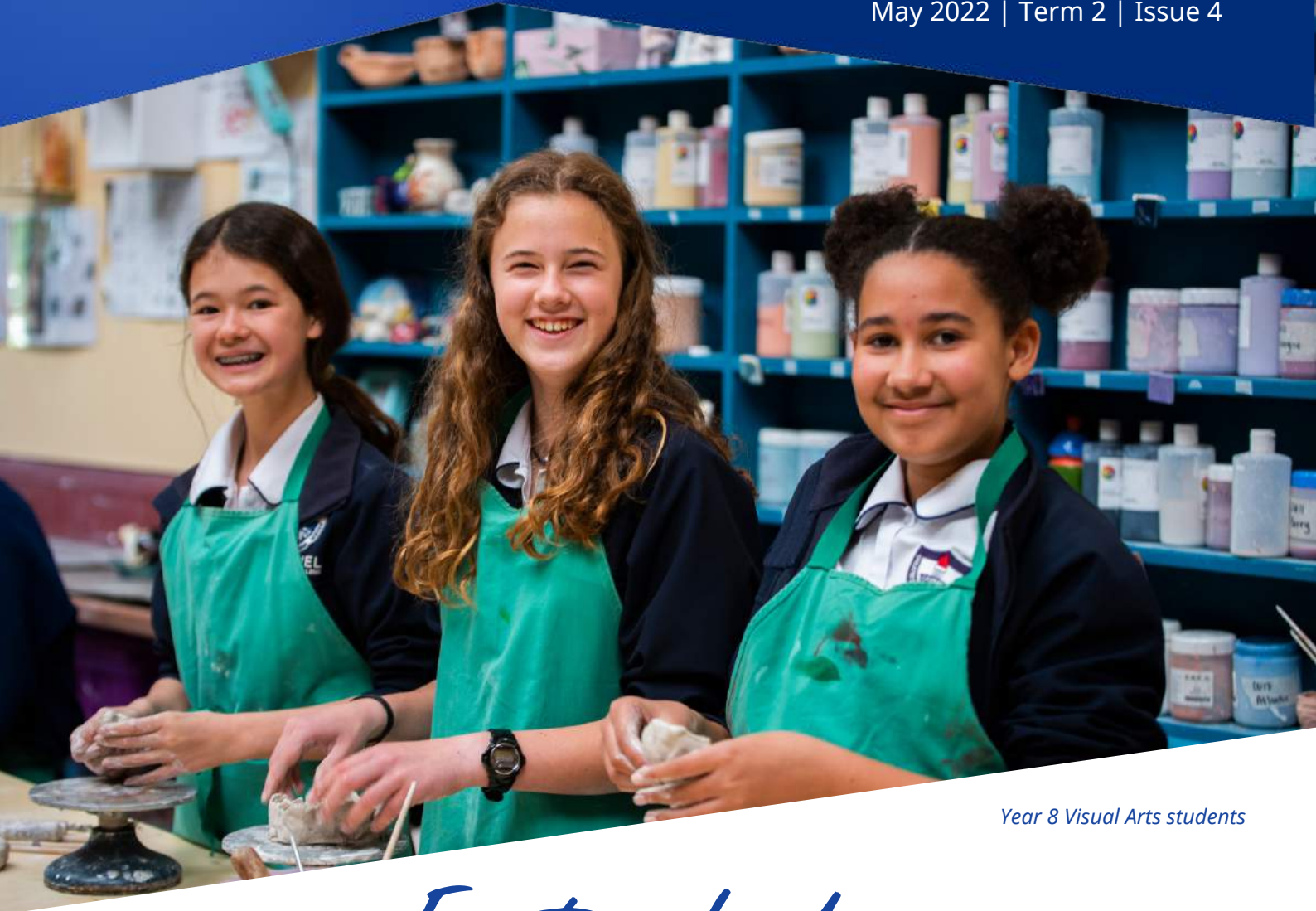
Year 8 Visual Arts students