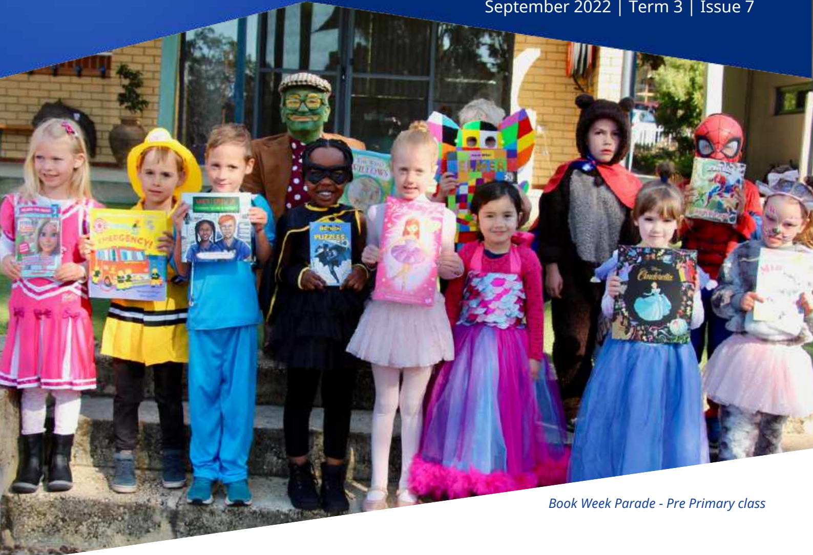
Book Week Parade - Pre Primary class