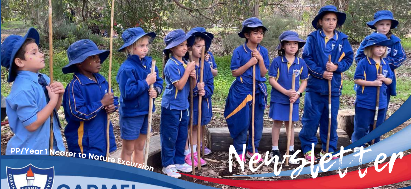
PP/Year 1 Nearer to Nature Excursion