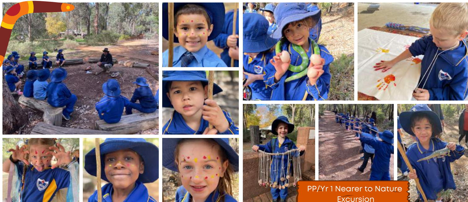
PP/Yr 1 Nearer to Nature Excursion