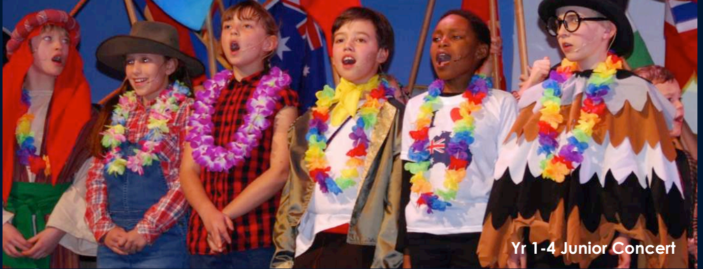
Yr 1-4 Junior Concert