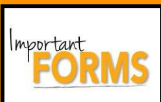
Narelle Duncan Registrar

On Registration Day you would have received an A4 envelope with a bright yellow label on the front with the following forms: