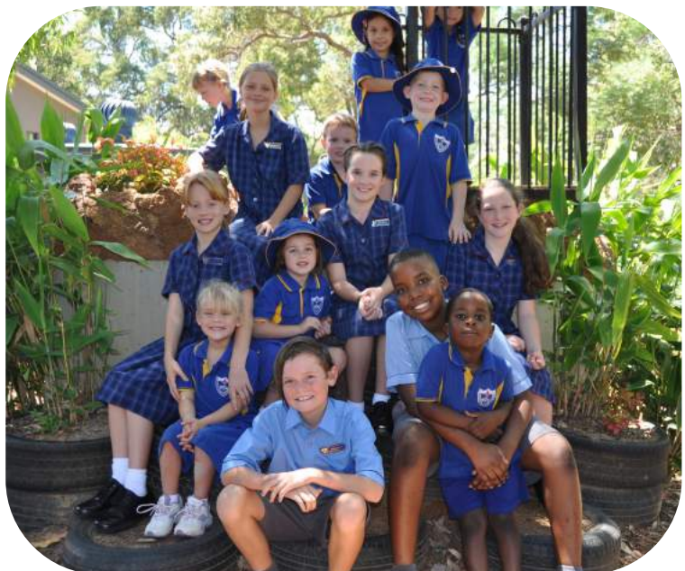
Student Leaders for 2017 with the Pre-Primary Buddies