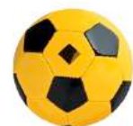
Mini Soccer Ball (size 2)

For every deposit made at school students will receive a silver Dollarmites token. Once students have individually collected 10 tokens they can redeem them for exclusive School Banking reward items in recognition of their regular savings habits. There are two new items released each term so be sure to keep an eye out for them!