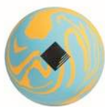
Twisted Power Handball

Exciting new Term 1 rewards with a Super Savers theme are now available, while stocks last!