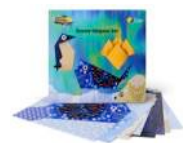
Snowy Origami Set

For every deposit made at school students will receive a silver Dollarmites token. Once students have individually collected 10 tokens they can redeem them for exclusive School Banking reward items in recognition of their regular savings habits. There are two new items released each term so be sure to keep an eye out for them!