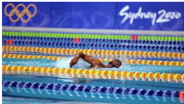
'Eric the eel'

https://www.readersdigest.co.uk/inspire/life/7-inspiring-olympic-heroes-who-beat-the-odds