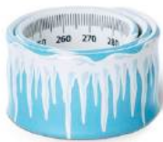
Icicle Slapband Ruler

Exciting new Term 2 Polar Savers rewards are now available, while stocks last!!