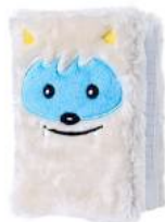
Yeti Fluffy Notebook

For every deposit made at school students will receive a silver Dollarmites token. Once students have individually collected 10 tokens they can redeem them for exclusive School Banking reward items in recognition of their regular savings habits. There are two new items released each term so be sure to keep an eye out for them!