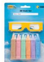
3D Chalk Set

School Banking day has now changed to every Wednesday .