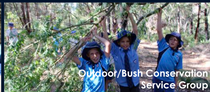
Outdoor/Bush Conservation Service Group