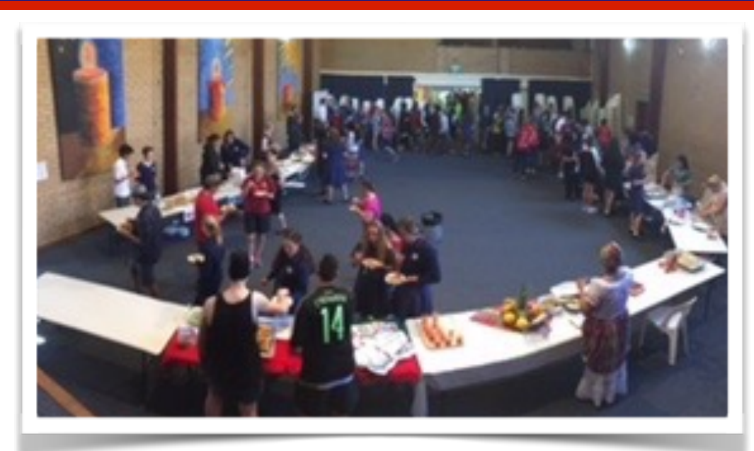
Students line up to enjoy a delicious, multi cultural lunch

Thank you to everyone who supported and we look forward to continue to celebrate our diversity in the future.