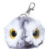
Arctic Owl Fluffy Keyring

For every deposit made at school students will receive a silver Dollarmite token. Once students have individually collected 10 tokens they can redeem them for exclusive School Banking reward items in recognition of their regular savings habits.