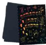
Scratch Art Cards

Exciting new Term 3 Polar Savers rewards are now available, while stocks last!