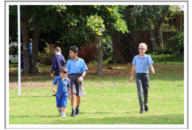
Year 6 students spending time with their Pre Primary Buddies