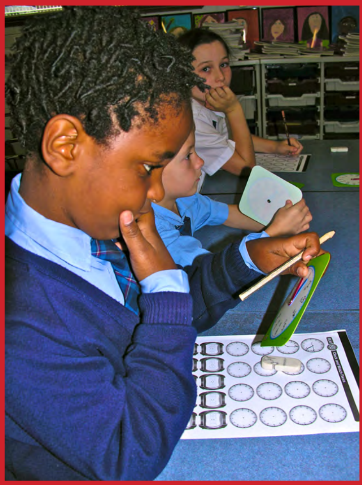
Students at work