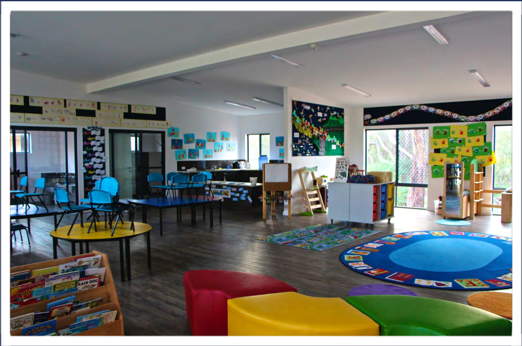
Construction of New Pre Primary Classroom and extension of outdoor play area.